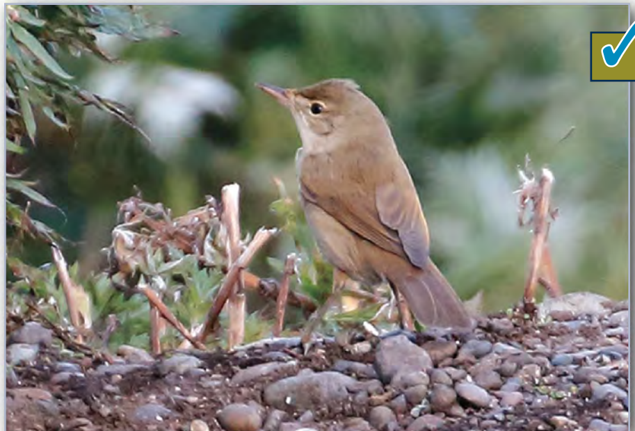
A member of the challenging genus Acrocephalus, this Blyth's Reed Warbler was carefully identified from a series of excellent photographs, including an in-flight image that shows the emarginated primaries. A record of a putative Blyth's Reed Warbler from the same location in 2010 was not accepted by the Alaska Checklist Committee, but the 2015 record was accepted unanimously. Gambell, St. Lawrence Island, Alaska, September 18, 2015.