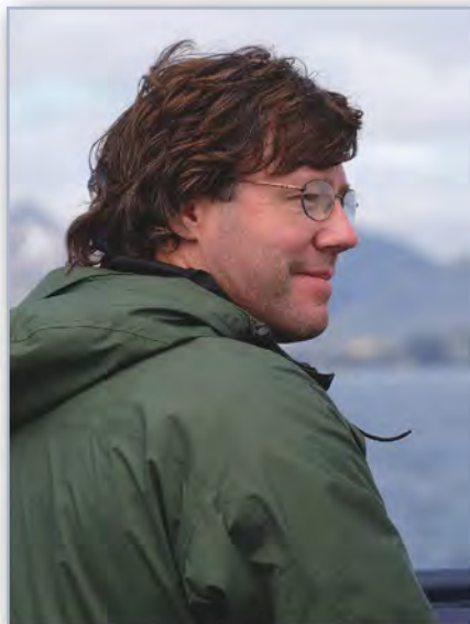
David Sibley is an author, writer, and naturalist best known for his The Sibley Guide to Birds and other books. He has traveled extensively throughout North America and abroad as a tour leader and lecturer. Sibley is a recipient of the ABA's Roger Tory Peterson award for lifetime achievement.

Union Check-list of North American Birds. Auk 133:544–560.