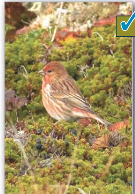
The two species added to the ABA Checklist from Alaska in 2015 were discovered within days of each other, although about 460 miles apart. The Pallas's Rosefinch is a little-known Asiatic species—and a short-distance migrant—that was not on most birders' lists of potential vagrants to the ABA Area. St. Paul Island, Pribilof Islands, Alaska, September 21, 2015.

So far this year, seven new potential additions to the ABA Checklist have been documented. The provenance of a Great White Pelican ( Pelecanus onocrotalus ), photographed at J. N.